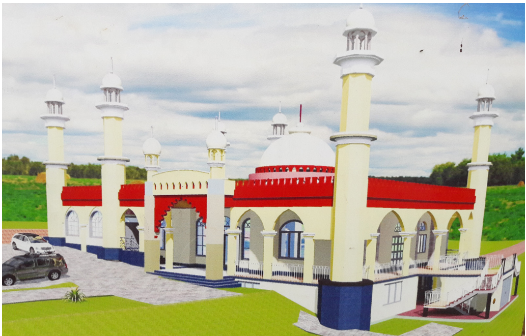
Artistic impression of how the completed structure will look like.