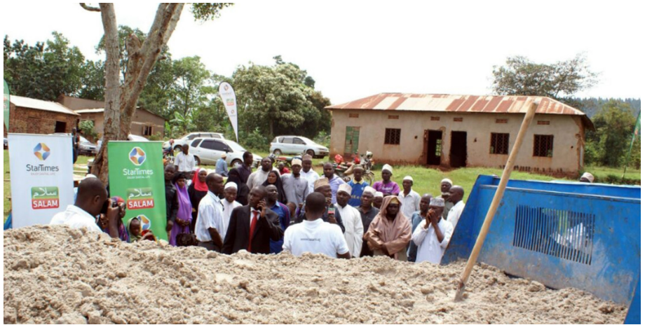
The Old Classroom block at Lukalu Quran School.

This centre nurtured Uganda's reknown sheikhs including Muftis over the years since its inception, however, by the time Salam Charity foundation came in to give it a helping hand, it had been reduced to a coaching center for pupils whose parents lived around it. A new classroom block was constructed with a capacity of 1000 pupils, and help the Trustees put up a function PTA board to manage affairs of the school. In a bid to bring back its glory days.