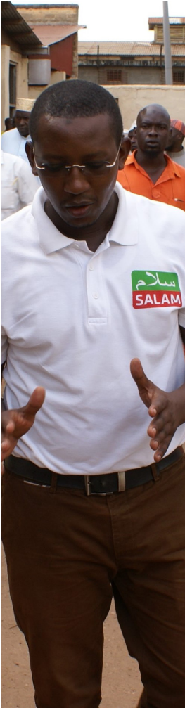
Salam Charity Operations Manager during a visit to Luzira maximum Prison