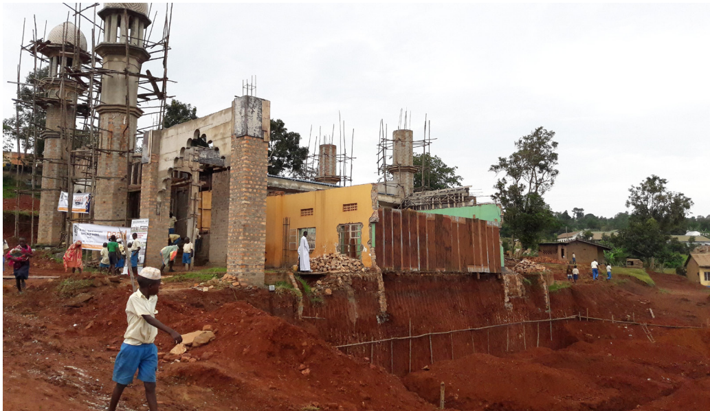
The Old Mosque (in middle of Picture), encompassed by the new structure during construction.

Through our mobilization drives, we contributed sh470 million towards the reconstruction of one of the regions oldest mosque Kabasanda main mosque to a standard that can match with the new developments of the area that have been put up by the government as it is centrally located in the town of Kabasanda.