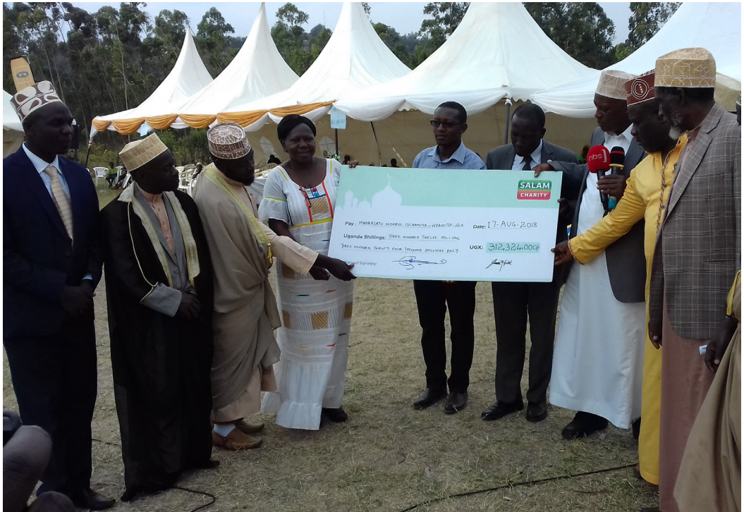
Nyamitaanga Madrast Noor management receive a dummy cheque of over sh300million from the Mbarara woman member of Parliament who was chief guest at the handover ceremony recently.

It is the first religious founded institution for Muslim in the Western region, but since its establishment, it has struggled to improve its infrastructure yet good infrastructure is one of the defining factors in the quality of education that our children get. This is the reason why a sh 312 million donation was made to this centre to facilitate the establishment of a two-storeyed classroom block which will also house the administration offices of the school.