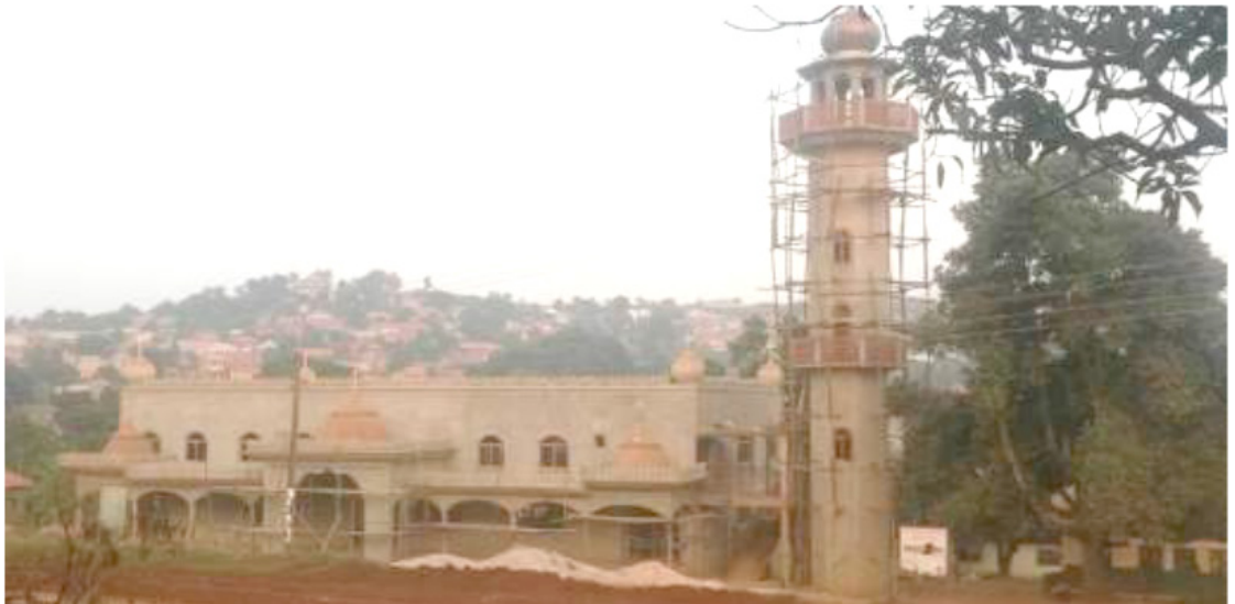
Lubugumu Masjid nearing completion