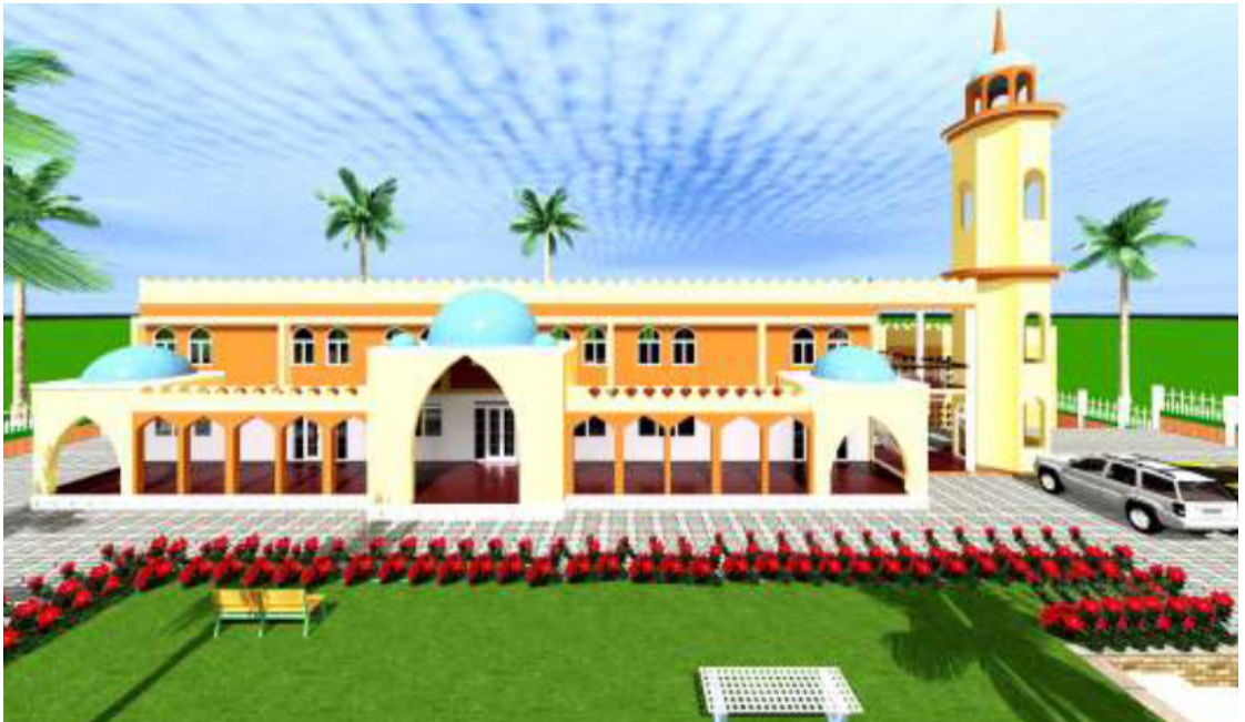
Artistic Impression of the completed one-storey structure.