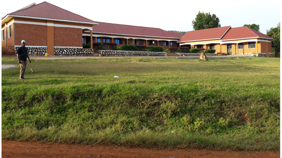
The New Classroom block at Lukalu Quran School.