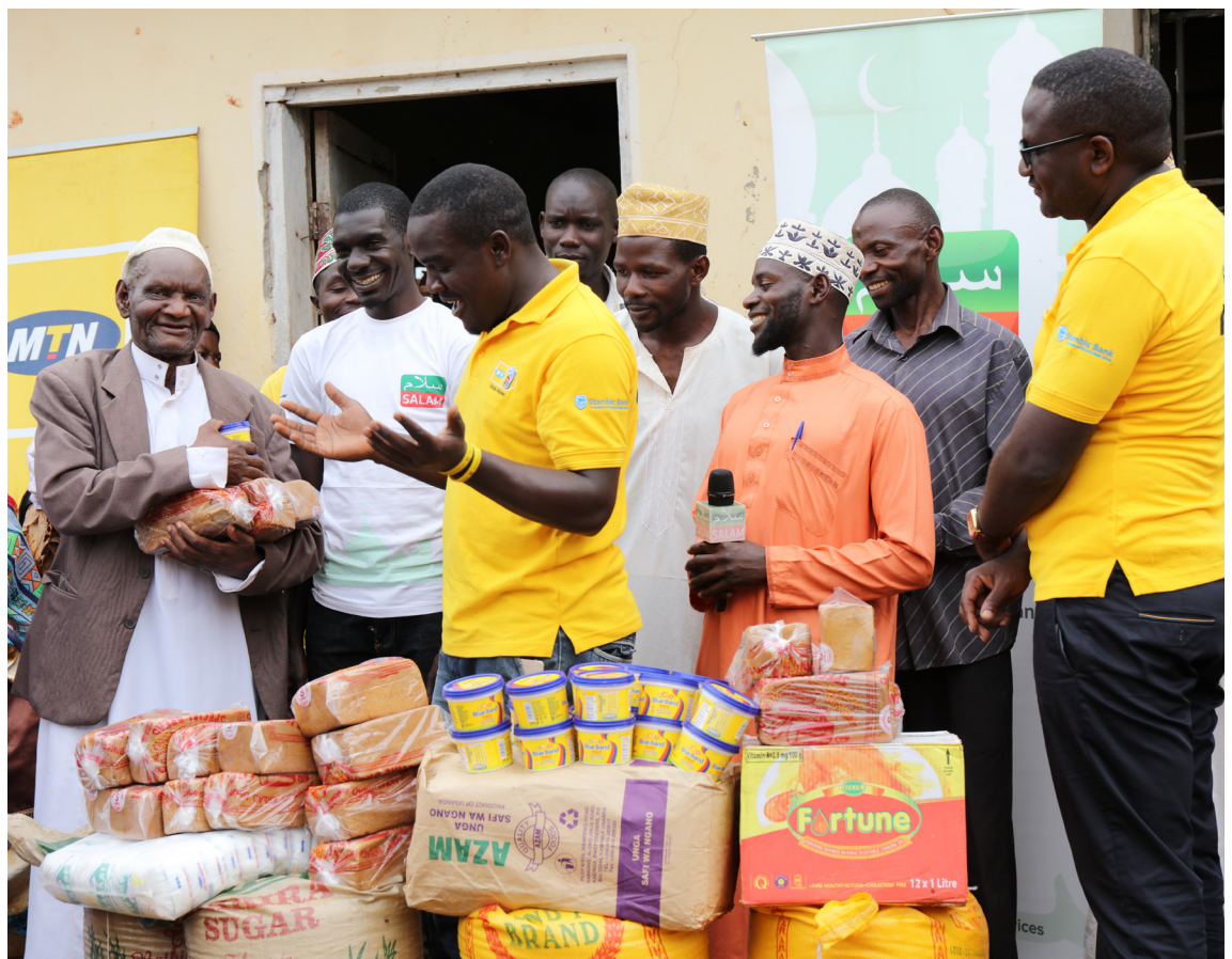
Salam Charity Ramadhan donation in partership with MTN